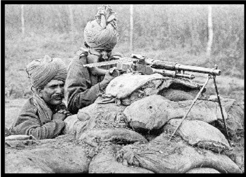
Indian Soldiers In France 1914