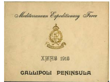
CANADIAN WAR MUSEUM

Read the letter from the soldier and write a reply, pretending the letter was sent to you.