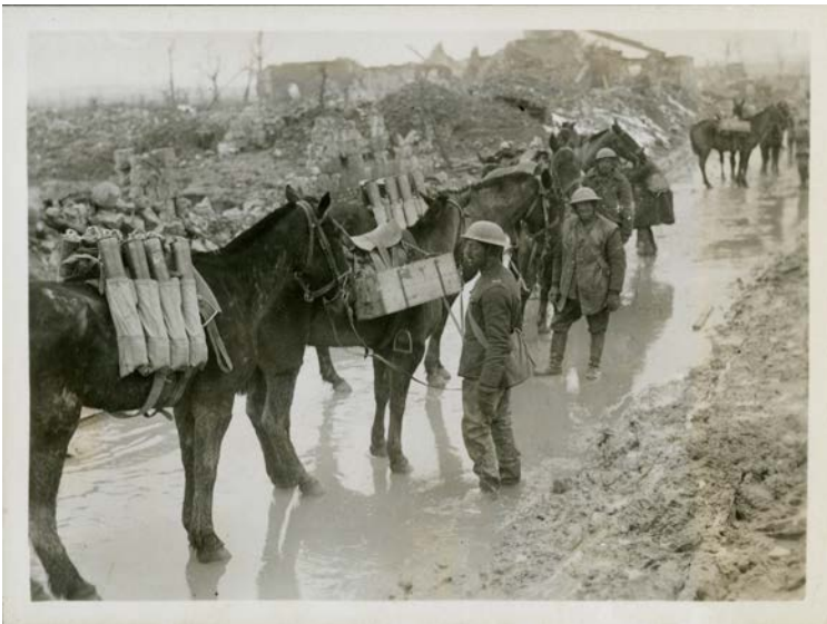
20th Battery, Canadian Field Artillery, taking ammunition to forward guns during the Battle of Vimy Ridge, April 1917.

In your opinion, what physical feature of the landscapes had the greatest influence on the fighting conditions in WWI?