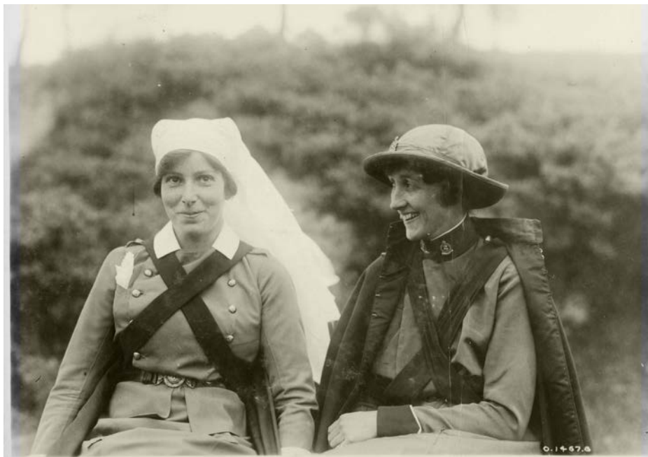
CANADIAN WAR MUSEUM

Write a letter to a newspaper in 1918 explaining why women should receive credit for the role they played in the war.