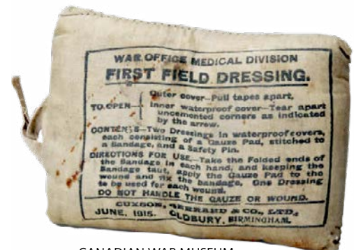
CANADIAN WAR MUSEUM

Assume the role of a WWI medic in the trenches. At the end of an exhausting day of caring for the wounded, you sit down to write a letter back home. Describe your feelings and the hazards faced by soldiers, and comment on the medical supplies that you have to treat them.